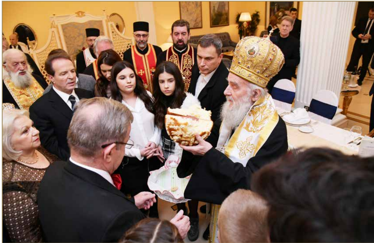
As part of a long tradition, Karić family started the celebration of St. John the Baptist on 19 January 2019 in the villa “Jelena”.