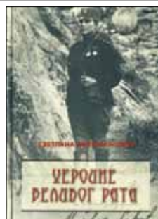
Хероине Великог рата