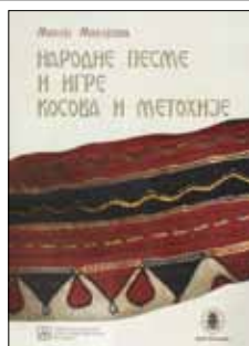
Песме и игре КиМ