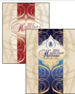
Награда БК 2012-2013