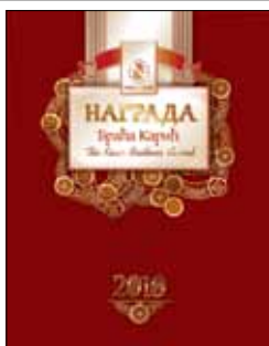
Награда БК 2006-2011