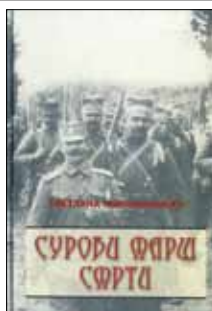
Сурови марш смрти