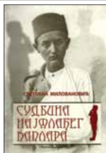
Судбина најмлађег каплара