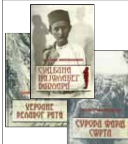
Трилогија I Св. Рат