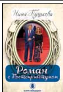
Роман са П.С.