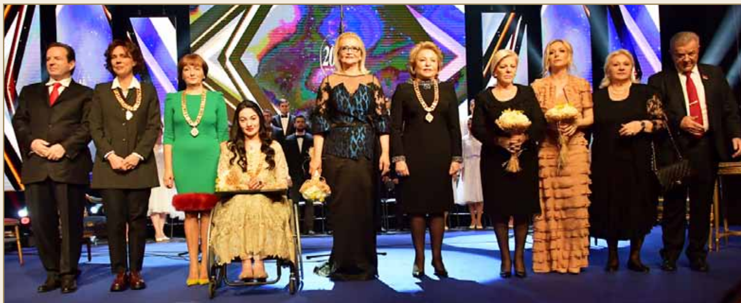
The "Karic Brothers" Award 2017 Laureates